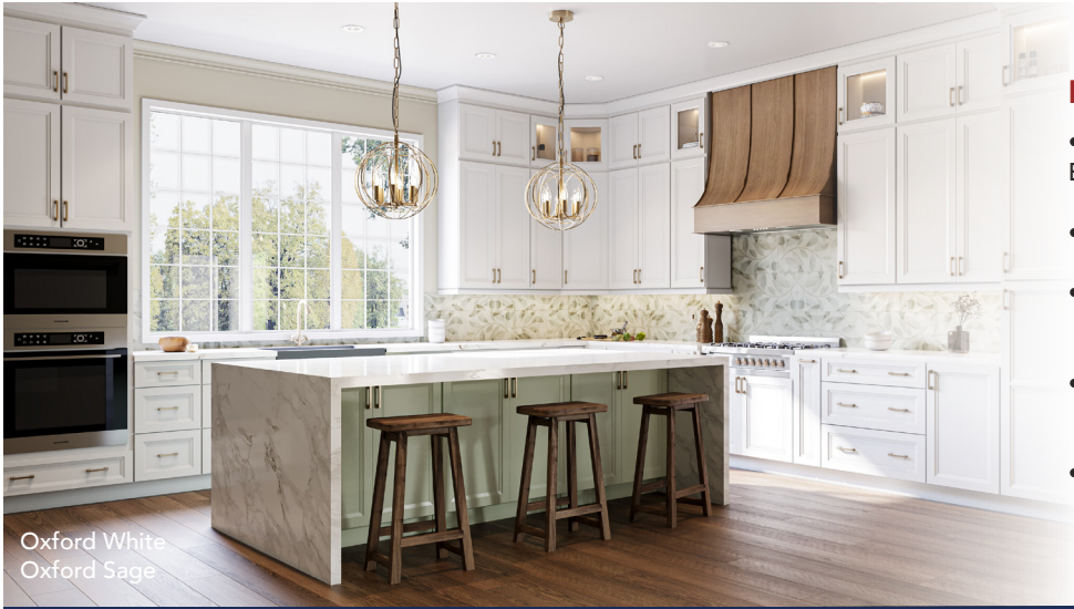
Oxford White Oxford Sage